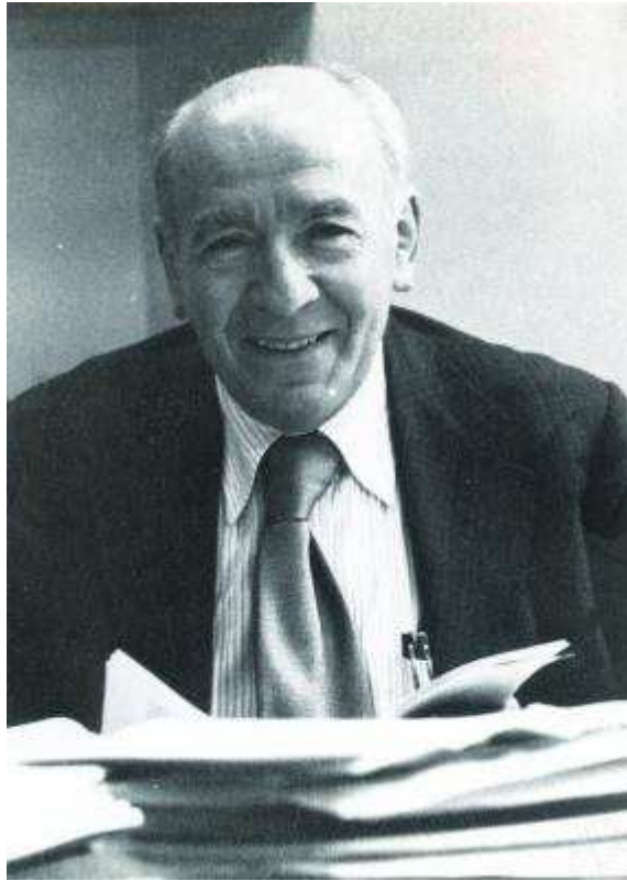
Mark Kac, circa 1980